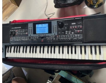
Figure 3. Keyboard 2 belongs to the music group Gambus El-Hubb