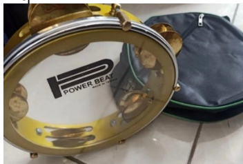
Figure 7. Riq belongs to the music group Gambus El-Hubb

Marawis is a percussion musical instrument shaped like a drum made from wood bark and goat skin. The marawis used by the music group Gambus El-Hubb have a diameter of 17 cm with a height of 12 cm. There are 3 marawis used for performances. The rhythm used when marawis plays is the zafin rhythm. The zafin rhythm is a mandatory rhythm with the marawis musical instrument, while the sarah and zaife rhythms of the marawis game must be present in certain parts. Marawis on baladi rhythms are not played.