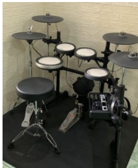
Figure 10. Drums belonging to members of the music group Gambus El-Hubb