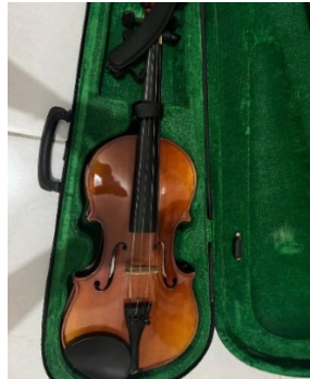
Figure 11. A violin belonging to a member of the music group Gambus El-Hubb