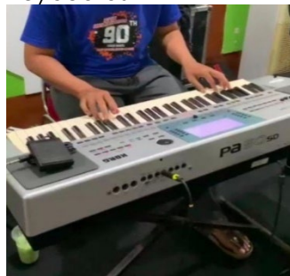
Figure 2. Keyboard 1 belongs to the music group Gambus El-Hubb