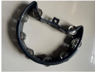
Figure 8. Tambourine belongs to the music group Gambus El-Hubb