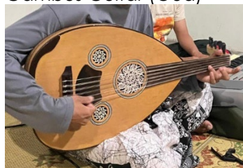
Figure 1. Gambus guitar (oud) owned by the music group Gambus El-Hubb.