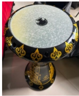
Figure 5. Darbuka belongs to the music group Gambus El-Hubb

The darbuka used by the Gambus El-Hubb music group is made from ceramic stone made in Egypt so that the sound characteristics produced appear louder. Darbuka has the main sounds, namely dung, tak, and pak. Darbuka is used as a rhythmic instrument used from the beginning to the end of the song. Darbuka is a percussion instrument.