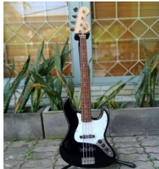
Figure 4. Bass guitar belonging to the music group Gambus El-Hubb