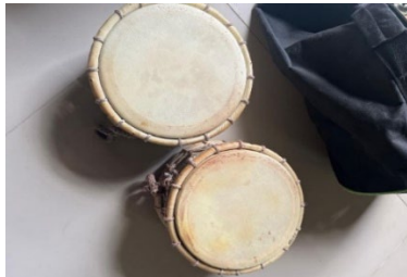
Figure 6. Marawis belongs to the music group Gambus El-Hubb

The darbuka used by the Gambus El-Hubb music group is made from ceramic stone made in Egypt so that the sound characteristics produced appear louder. Darbuka has the main sounds, namely dung, tak, and pak. Darbuka is used as a rhythmic instrument used from the beginning to the end of the song. Darbuka is a percussion instrument.