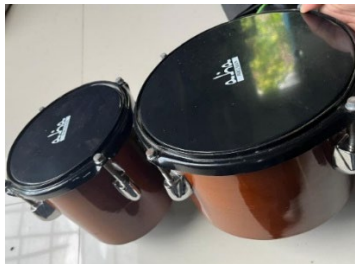
Figure 9. Tam-tam belongs to the music group Gambus El-Hubb