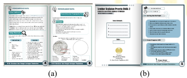
Fig. 2: (a) Content of electronic worksheet 1 (b) Content of electronic worksheet 2

The stages of "Formulating Problems" and "Formulating Hypotheses" invites students to formulate problems related to plant tissues based on the environment in which they grow, as well as formulate temporary assumptions based on the problem formulations that have been made. The "Exploration" stage invites students to be able to find and identify their discovery. The "Analysis" stage invites students to logically analyze the results of exploration, and the last stage "Formulating Conclusions" invites students to conclude what has been obtained based on the activities carried out in the previous stage. All of stages in the electronic student worksheets attract students to follow the interactive teaching and learning activities. The content of both electronic worksheets can be seen in Figure 2.