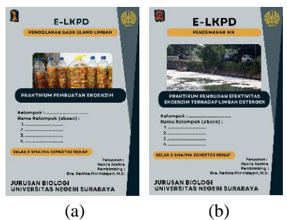
Figure 2. (a) 1st E-worksheet; (b) 2nd E-worksheet

The e-worksheet contains two learning activities; the first e-worksheet contains student activities to make an eco-enzyme as an effort to process organic waste. The second e-worksheet contains student activities to conduct practicum testing of eco-enzymes to overcome the detergent waste.