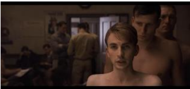
Image 1: This scene is when Rogers wants to join military in World War two.

As you can see in the image above, Steve Rogers is on a call to see if he is fit for military service. This is the first problem that Steve Rogers must face. He insists on joining the military because he wants to follow his father's path. He wants to fight like real soldiers who put their lives at risk to protect their country. However, in image one, Steve Rogers is a tiny young man, perhaps too skinny for ordinary people, shorter and wobbly even while walking. A hero's journey might begin with a variety of circumstances. In the case of Steve Rogers, the pattern of the hero's journey always begins with the hero himself.