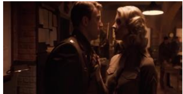
Image 11: In this scene, a woman is attracted to Rogers and attempts to seduce him.

Words spoken to men can sometimes make men helpless and tend to control by lust which at the same time, increases a sexual desire. As shown on image above, Rogers who rarely spoke with a woman at that time seems nervous and helpless at the words spoken by that woman. Even when the woman pulls his clothes, he cannot do anything except give up. Peggy catches them kissing which makes Rogers nervous and accidentally offends Peggy. This makes them argue simply because of the problem of a woman.