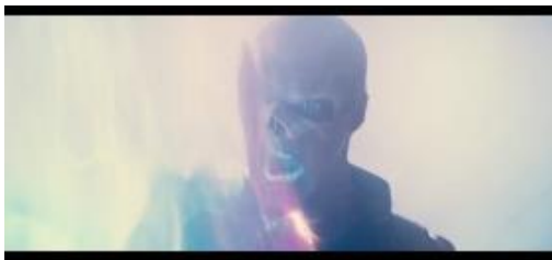
Image 13: Schmidt was burnt until nothing left after touching the plane's core.

Previously, a meeting held to hunt down Schmidt. Then it determine that Rogers would strike Hydra's last base directly. Rogers and the other soldier successfully enter the Hydra's last base. Rogers initially enters as a prisoner alone as bait, to find out exactly where Schmidt is. Rogers hustles inside their base and manages to meet up with Schmidt. Schmidt was beating Rogers at that time. Just before he gets shot by Schmidt, the other soldiers rush in and attack the Hydra base. After the attack, Schmidt fled by plane. Rogers knows that happen and immediately chases him with Peggy in a car. He finally can board the aircraft and then sneaks into a room. There, he directly got shot by Schmidt. They fought fiercely, Rogers attacking Schmidt with his shield and sending Schmidt crashing and damaging the main engine of the plane. Schmidt instantly death as he touches the engine's core. After going through all the challenges he faces before, he finally successfully achieves his goal, executing Schmidt and destroying the Hydra headquarters. With Schmidt's death, Steve Rogers' hero journey has come to an end.