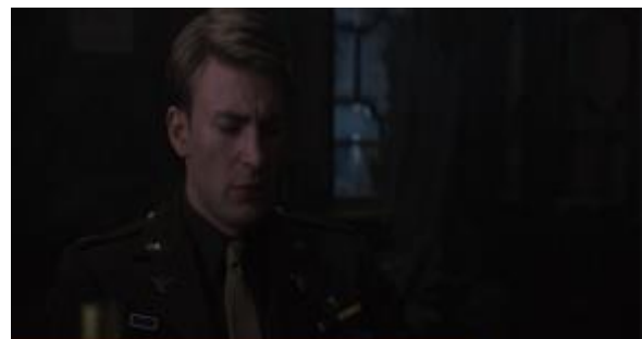
Image 12: Rogers feels sad and frustrated after losing his friend.