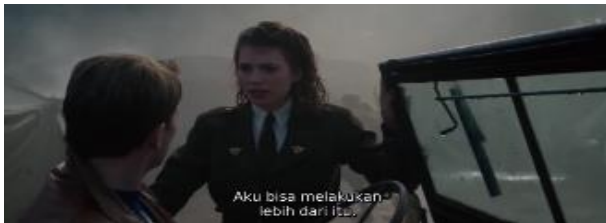
Image 10: Peggy is eager to assist Rogers as much as she can, in order to help Rogers' mission successful..

Unfortunately, bad things occur. During their conversation, Rogers knows that his best friend James Barnes "Bucky" was caught by the enemy and reportedly did not survive. Rogers convinces that his friend is still alive, and Rogers plans to carry out a rescue mission on his own. Peggy then follows him and convinces Rogers that she can help him. Peggy informs Rogers of the enemy's coordinates and assists him as much as possible to ensure the mission's success.