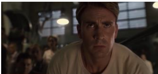
Image 7 : Rogers shows his anger emotions due the death of doctor Abraham Erskine.

The first trial he must face is the pursuit of Doctor Erskine's murderer. Previously, following a successful super soldier project and Rogers successfully becoming a "superhuman", Doctor Erskine was shot by an unknown man. Rogers, rage by that accident, begins to pursue the murderer. At first, he confuses because of his new physique. He is still unable to fully control his