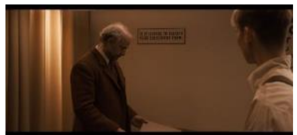
Image 3: Doctor Abraham Erskine summoned Rogers to a private room to interview him.