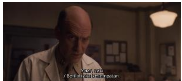
Image 2: In this scene, the Doctor rejects Rogers registration because Rogers was diagnosed with many ailments.

This stage is about the hero facing the unknown things in his journey. The hero may feel negative about what is going to happen throughout the journey. As a result, Rogers got a rejection from the military. And the worst is, upon further inspection, he has an even worse problem. He is diagnose with a various list of ailments, one of them is asthma. The doctor even said, (00:08:55 – 00:08:59)" sorry son, you won't be able to regis for asthma alone ".