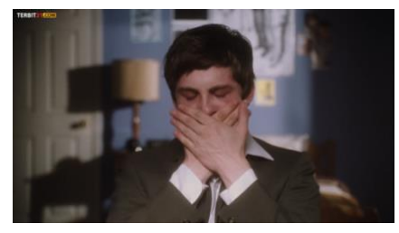
Data 24 (Charlie feel anxiety, at 1:29;44)

After Sam and Patrick left home to wander and attend college, Charlie began feeling anxiety creeping into his mind. From Data 22, this film wants to convey a picture of anxiety to the audience through the displayed cinematics. In Data 22, Charlie is seen splitting into three people, which shows Charlie's mixed feelings and anxiety. The data the researchers got from the film script, namely "If you've never had an anxiety attack, this is how it feels", proves that Charlie is experiencing anxiety. A mental health condition called anxiety is characterized by excessive concern and dread. When someone has anxiety, they will naturally find a means to handle it. Anxiety results from feeling uneasy, restless, annoyed, and intimidated by a situation. However, the root reason for worry is not often apparent or understood. In Data 23, Charlie is seen banging his head right on the door of his house while saying, "It's my fault. It's all my fault." which means that Charlie blames himself for what has happened to other people.