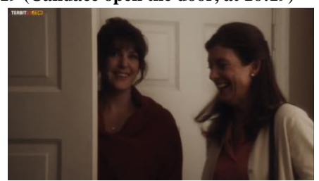
Data 20 (Charlie's flashback about Aunt Helen, at 16;13)