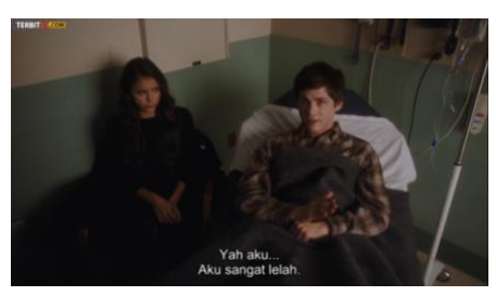
Data 7 (Charlie at Hospital after Blackout at 54:50)

After experiencing the flashback in the Data 1, Charlie felt like his soul tossed around, disconnected from his surroundings, and his vision start to blurry in Data 6 which uses long shot cinematography as if to show the whole situation that was in front of Charlie. Charlie felt like he was in a dream that was not real, even though he was at a New Year's Eve party with his friends. As shown in Data 6 obtained from the film script "The crowd cheers, leaving ghosts of themselves" shows that Charlie feels like his environment is unreal or dreamy. After experiencing flashbacks and dissociation, the next scene is Charlie in the hospital because the police found him lying on the street. The scene that immediately jumps out that Charlie is in the hospital after the scene of Charlie's flashback at the turn of New Year's Eve, shows that the dissociation that Charlie is experiencing leads to a blackout. Dissociation are disconnection from thoughts, feelings, or identity such as daydreaming, being disconnected from the body or surroundings, or experiencing glimpse of traumatic memories (Van der Kolk, 2014). In this case, Charlie's flashbacks cause him to dissociate due to a very heavy traumatic memory about Aunt Helen who sexual abused him.