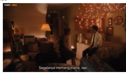
Data 5 (Charlie finally speaks from the heart to Sam, at 1:25:37)