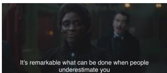
Figure 11 Mira Troy's Revenge as A Rebellion To Break Gender Stereotype (01:47:37 – 01:48:38)

The depictions in Enola Holmes 2 that the majority of society underestimate women's ability and create many limitations of women's life drive female characters in Enola Holmes 2 to do a rebellion as a real action to break the gender stereotypes. The first evidence of rebellion as an action to break gender stereotypes is the revenge of Mira Troy. In the scene when Enola, Sherlock, Sarah, and Mr. Tewkesbury are fight against Superintendent Grail and his subordinate in theater which seized the evidence of corruption by Lyon Matchstick Factory who killed a lot of female workers due to phosphorus as contamination as toxic liquid but claimed as died of typhus. Sherlock who tried to analyzed the corruptor from codes and evidences that he obtained before figured out that it was Mira Troy action with dialogue bellow: