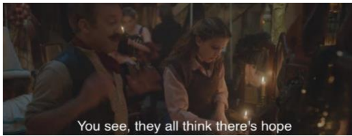
Figure 4 The Performance Manager Look Down Women in Society As A Toy To Played For Nobleman (21:00 – 21:23)