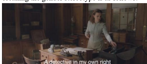
Figure 8 Enola Holmes Opening Detective Agency to Be Equal With Her Brother (01:44 – 01:55)

The first action that depicted Enola Holmes when the female character tried to break the gender stereotype is in the opening scene. Enola, who understands that there are many limitations of women in society, tried to become a detective as an action to break the gender stereotype of a woman who is seen as weak and unskilled so she can have an equal position in society. The evidence of Enola breaking the gender stereotype is as follows: