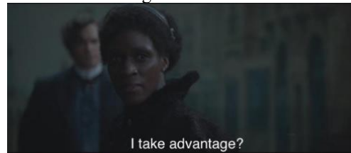
Figure 6 The Anger of Mira Troy Regarding Inequality Between Men and Women in Society (01:50:05 - 01:51:05)

The fourth evidence that depicted gender stereotypes in Enola Holmes 2 when women were seen as a submissive human being can be seen from the dialogue between Lord McIntyre and Mira Troy. In this scene Mira Troy reveals who she really was. The suppressed emotions due to pressure when she was working under Lord McIntyre made Mira Troy also commit crimes by stealing money under the reason of discrimination that she has received this far with dialogue below: