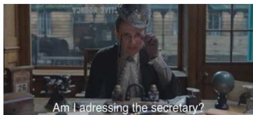
Figure 2 Potential Clients Underestimate Enola Skill as Detective (02:09 – 03:00)

Client: "Am I addressing the secretary?"