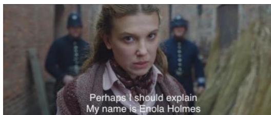
Figure 1 Opening Scene When Enola being Chased by The Police (01:15-01:25)

In the opening scene Enola Holmes is explaining her goal in the future to become equal with her brother by creating a successful career as detective like a well-respected Victorian detective in the past and Enola becoming the first successful woman detective which has never happened before. This scene is depicted of gender stereotype in Enola Holmes 2 when a women seen as a weak human being who have no right to create their own career with the evidence below: