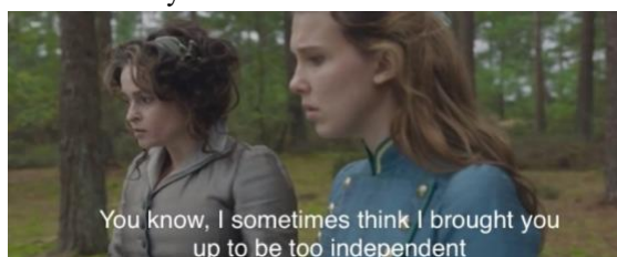
Figure 10 Eudoria Suggestion for Enola To Find Her Ally In Her Action To Break Gender Stereotype (01:18:45 – 01:19:37)

In Enola Holmes 2 , this action of breaking gender stereotypes is depicted when Eudoria and Edith try to take Enola to the prison and run away from the police. After breaking into the prison walls with a bomb, they tried to run away from the police with a horse cart and also fought against Superintendent Grail and his subordinate. Eudoria Holmes as Enola's mother started to question her daughter's condition and felt that all of her children were too independent and lonely. Eudoria also gave an advice to Enola regarding her action to prove her worth and abilities in society with the evidence below: