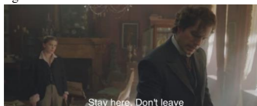
Figure 7 Sherlock and Enola Arguing On How Enola Emotion Trapped Her to Dangerous Situation (44:15 – 44:18)

Lastly, gender stereotype that depicted in Enola Holmes 2 is women seen as an emotional human being. This depiction is in the scene of when Sherlock Holmes argued with Enola Holmes after finding out that Enola became a suspect in Mae's murderer case. Sherlock that was angry blames Enola for unable to control her emotions and makes her trapped in a complicated situation with the dialogue below: