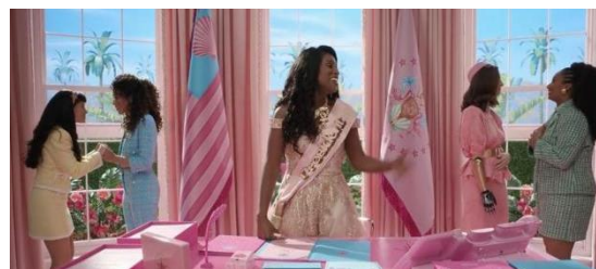
Figure 2 : Woman as A President Timestamp: 00.06.50

In the context of women's empowerment, financial independence plays a crucial role in enabling women to assert their autonomy and rights within society. Rowlands (1997) highlights that financial independence provides women with the means to make decisions independently and exercise control over their lives. By having economic agency, women are better positioned to navigate societal norms and structures, ultimately leading to greater empowerment and self-determination. Barbie's depiction of financial independence serves as a powerful symbol of women transcending societal boundaries to achieve financial stability and autonomy. It emphasizes that women can determine their fate and guarantee their independence in various aspects of life. The film also conveys the message that girls can be anything they aspire to be if given the opportunity and resources to thrive. By connecting Barbie's financial independence to the broader theme of women empowerment, the film urges the importance of providing women with the tools and support they need to achieve their goals and overcome social barriers. Barbie's character serves as an inspiration to girls, showing that with determination, resilience, and access to resources, they can overcome limitations and achieve success.