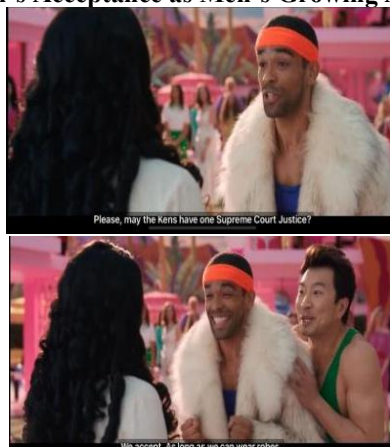
Figure 8 : Ken asks for a job position under the leadership of the President Barbie Timestamp: 01.38.25 - 01.38.41