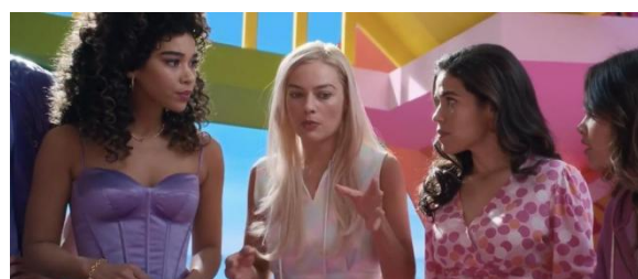
Figure 3 : Barbie Margot leads a discussion Timestamp : 01.17.16

Barbie (2023) is a film that highlights the significance of financial independence for women's empowerment. The film portrays Barbie as the President, highlighting the role of economic stability in enabling women to self-sufficiency and decision-making autonomy. This is in line with Rowlands's perspective on the role of economic conditions in women's empowerment. The film highlights the importance of financial independence in enabling women to make choices that align with their goals and have a voice in decision-making processes. Barbie's journey towards financial independence as President not only represents personal progress but also challenges power structures that have long marginalized women. The film supports the idea that women empowerment involves changing societal norms and structures to create a more equitable environment. The film's portrayal of Barbie as President not only demonstrates her personal power but also represents resistance to power and gender equality. It emphasizes the importance of women's ability to control their financial resources in asserting their rights and autonomy. Barbie's leadership as President signals a larger movement to change societal norms and structures, creating a more equitable environment for women.