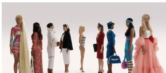
Figure 1 : Barbie with various professions Timestamp: 00.03.03

Barbie (2023) is more than just a cinematic depiction of a beloved cultural icon. It is a poignant commentary on women's empowerment in contemporary society. Through the lens of feminist theory and the concept of women's empowerment, the film challenges audiences to rethink gender dynamics and embrace diversity in all its forms. By depicting Barbie Margot's journey towards self-discovery and empowerment, the film inspires audiences to advocate for equality and justice, encouraging collective action and solidarity among women everywhere.