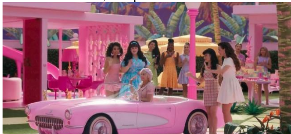
Figure 4 : Barbie Margot says goodbye to all Barbies Timestamp: 00.25.29

The film Barbie Margot is a powerful example of women's empowerment, showcasing her journey towards self-confidence and assertiveness. She leads discussions and fights for gender equality, overcoming challenges and societal expectations. Barbie Margot's character is a role model for empowerment, demonstrating the power of self-confidence in character development. Rowlands views on women's empowerment emphasize the importance of self-confidence in enabling women to assert their rights and make choices in society. Rowlands believes that self-confidence is the key for women to challenge power and social norms that marginalize them, leading to gender equality and a fairer environment. Barbie Margot's journey to self-confidence demonstrates how individual empowerment can drive social change and gender equality. Barbie Margot's leadership in leading discussions underscores the importance of self-confidence in empowering women. By depicting her as a confident and assertive character, the film highlights the impact of self-confidence in challenging societal norms and supporting gender equality. Her portrayal of a strong and determined character demonstrates how self-confidence can empower women to overcome obstacles and encourage positive change. This aligns with Rowlands's perspective of empowerment as a process influenced by cultural norms, economic conditions, and political structures.