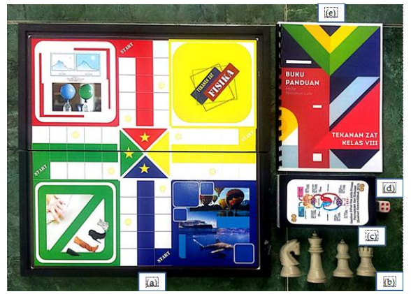
Figure 4. The Final Result of The Development of Ludo Game; (a) Board games, (b) Pawns, (c) Game Cards, (d) dice, and (e) Game Guides

The final results of the developed ludo game are presented in Figure 4 as follows: