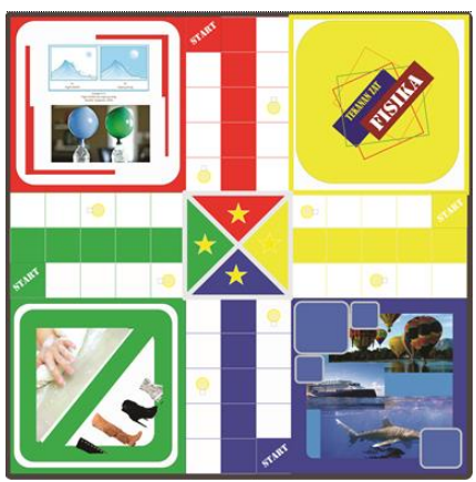
Figure 2. Board Game Design

step plots, 4 finish plots and 4 home plots. Each plot has readings and questions on the card.