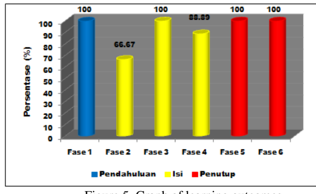
Figure 5. Graph of learning outcomes

communicating goals to students (phase 1), followed by a core phase of providing information activities (phase 2), guiding students to form learning groups (phase 3), and guide the group to learn and work (phase 4), and end with a concluding phase that contains evaluation activities (phase 5) and gives rewards (phase 6). The results of the implementation of learning are presented in Figure 5 below: