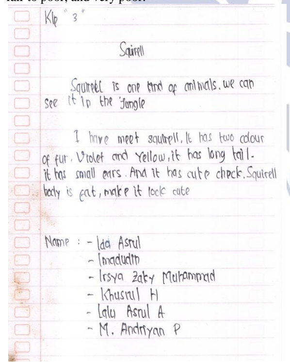
Figure 4.4 Students writing composition

The aspect of language use dealed with tense, number, word order or function, articles, pronouns, and preposition. Since the composition analyzed was descriptive text, the evaluation of language use included the use of simple present tense, subjective opinions, abstract nouns, adverbs, modals, connective, emotive words, compound and complex compound. Here, the researcher discussed and gave examples of student's composition that improved in term of language use. The criteria of scoring were excellent to very good, good to average, fair to poor, and very poor.