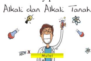
Figure 1. The welcome page draft media

Media made with flash and produce software applications with format.exe. Application of this media can be played on any computer or laptop device however it does not have Macromedia Flash applications. Here scene the opening pages of the first draft media video demonstraton of chemistry produced: